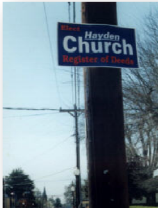
Example of an illegal sign

This brochure is intended to be a quick reference guide for persons running for office and those supporting these candidates. You will find sign standards in full on the City's website www.greensboro-nc.gov/ldo . Article 30-14.